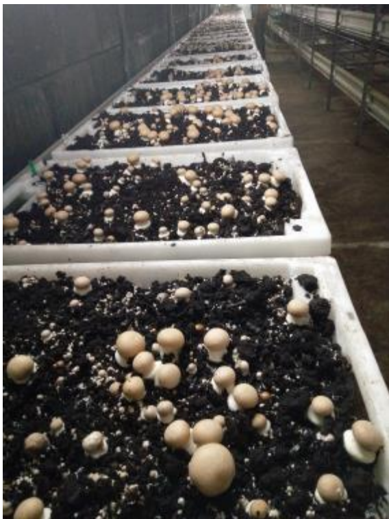
Experiment for testing the efficacy of sciarid control products